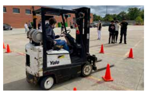
Wayne students are learning forklift and aerial lift training as well as ladder safety in the first few weeks of the new Construction Technology Class offered through a partnership between Huber Heights Schools and MVCTC.